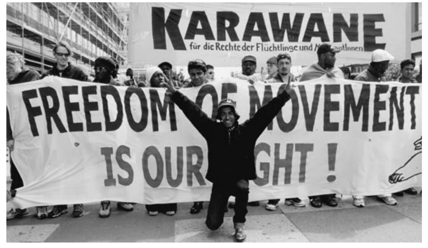
10-Years Anniversairy Actions and Events